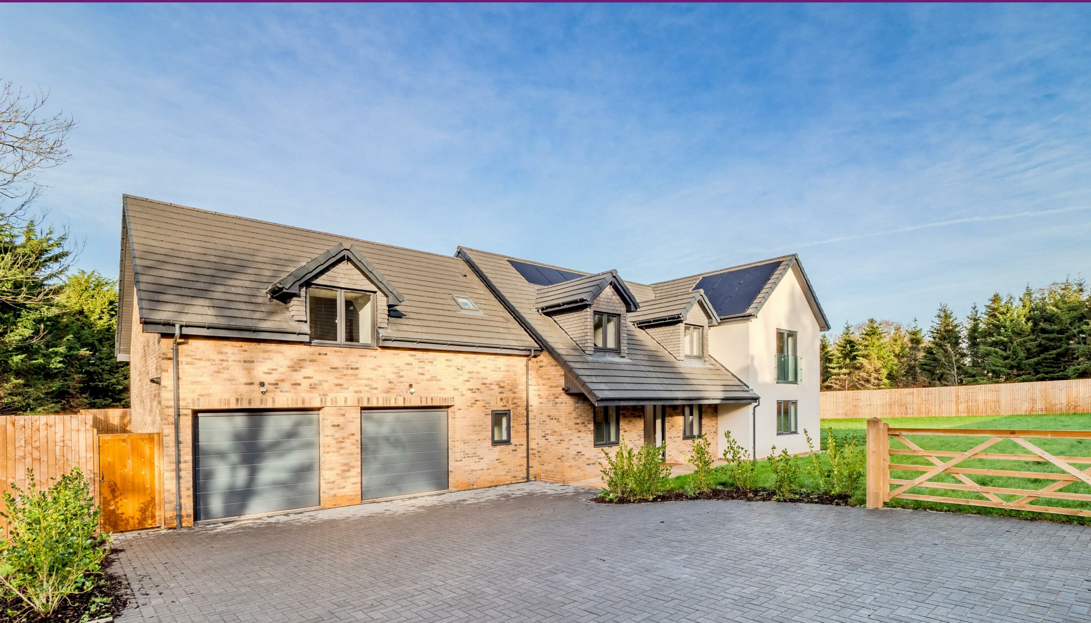
WISTERIA HOUSE, BROCKLEY NURSERIES MAIN ROAD, BROCKLEY COOMBE, BS48 3AT